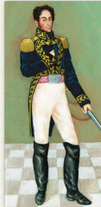
After winning South American independence, Simón Bolívar realized his dream of Gran Colombia, a sort of United States of South America.